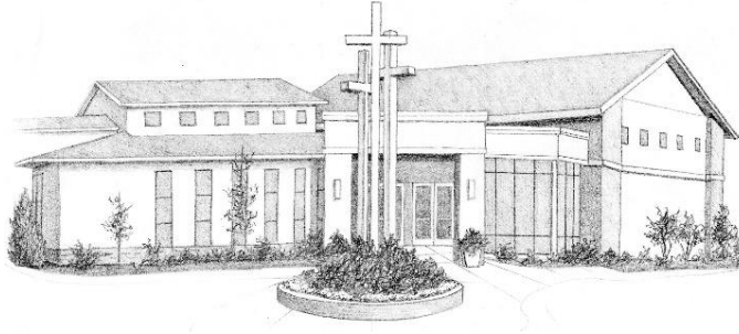
ELH Rite 4, Chorale Service, no Communion page 107